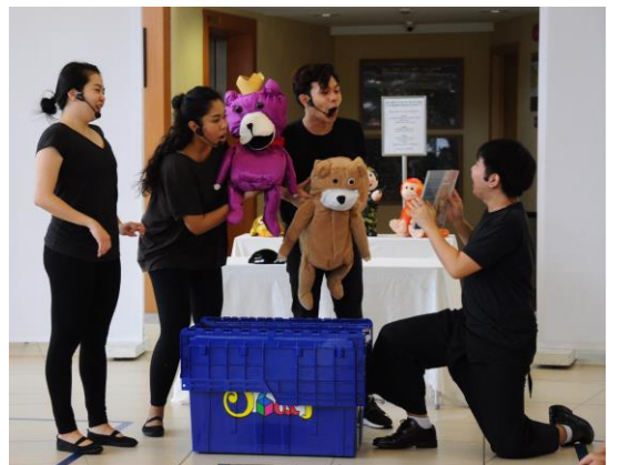
Prince Bear and Pauper Bear