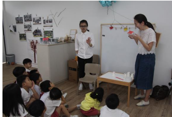
The True Story of the 3 Little Pigs