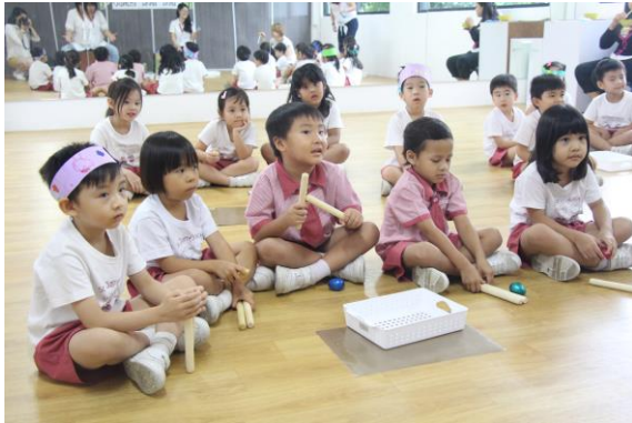
Tikki Tikki Tembo

The Wonderful World of Stories! camp for the K1 children was a wonderful way to end the term. The children were led by our teachers through different activity stations where they engaged with a variety of hands-on activities based on selected English and Chinese stories. Stories were brought to life through music & movement, craft, and literacy games. The children's imagination and creativity were tickled as they delved into the world of stories. They also enjoyed the live interactive multi-sensory performance of "Prince Bear & Pauper Bear" staged by The Learning Connections (TLC). Here are some snippets of the fun we shared!