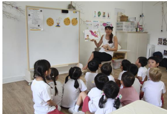
If You Give a Mouse a Cookie